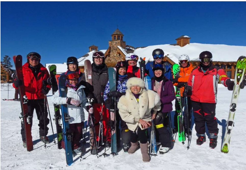
Winter Park Gang!!