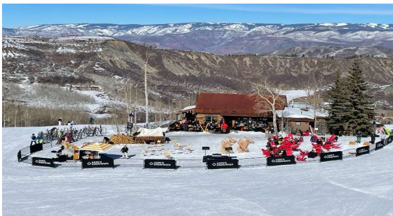
One of many places on the mountain to enjoy a break.