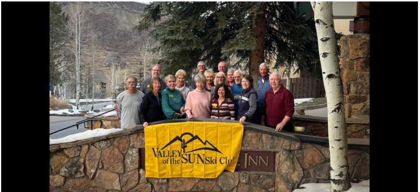
The Snowmass Gang

Respectfully submitted by Sandy Tiedeman- Recording secretary