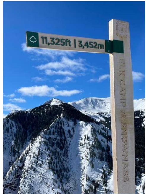
How High Can You Go!