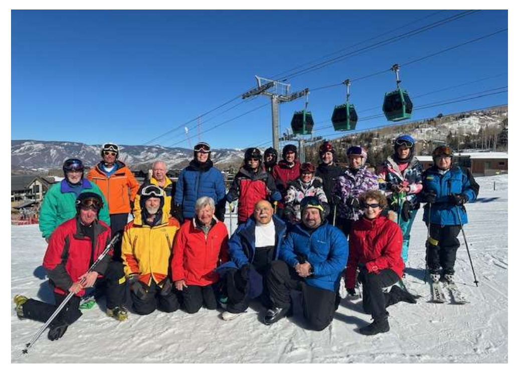
Snowmass Gang 2025